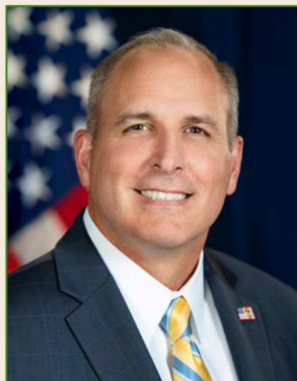
MARK MORGAN, Acting Commissioner, U.S. Customs and Border Protection