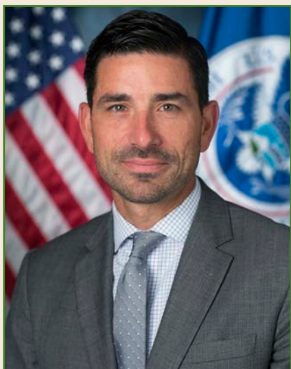
CHAD WOLF Acting Homeland Security Secretary